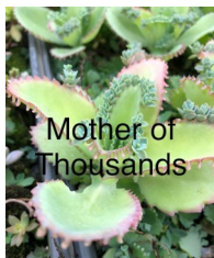
Mother of Thousands