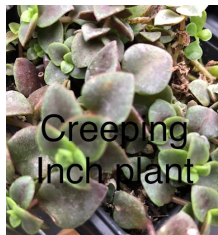
Creeping Inch Plant