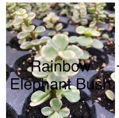
Rainbow Elephant Bush