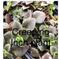
Creeping Inch plant