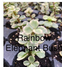
Rainbow Elephant Bush