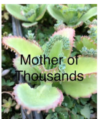
Mother of Thousands