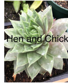
Hen and Chick