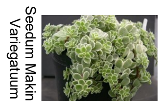
Sedum Makinoi Variegatum

Although every effort is made to assure that we offer quality plants, our suppliers give us no guarantee; therefore, we cannot replace plants that do not survive. In addition, Allegheny County 4-H does not assume responsibility for plants picked up after the designated date.