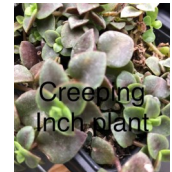
Creeping Inch Plant