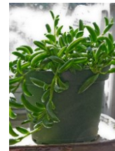
String of Bananas