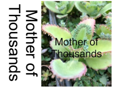
Mother of Thousands