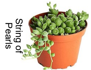
String of Pearls