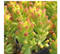
Pork & Beans