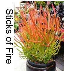
Sticks of Fire