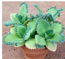
Mother of Thousands