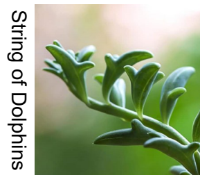
String of Dolphins