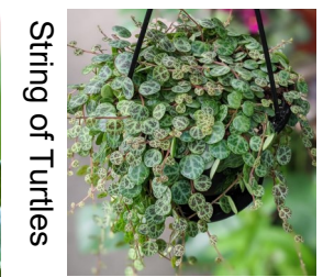
String of Turtles

ALTHOUGH EVERY EFFORT IS MADE TO ASSURE THAT WE OFFER QUALITY PLANTS, OUR SUPPLIERS GIVE US NO GUARANTEE; THEREFORE, WE CANNOT REPLACE PLANTS THAT DO NOT SURVIVE.