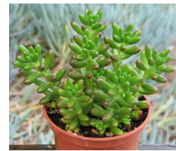
Pork & Beans