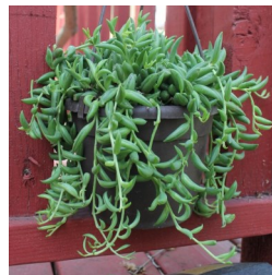
String of Bananas