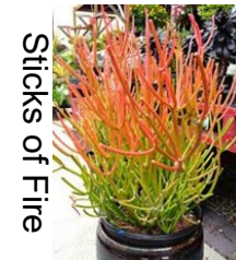
Sticks of Fire