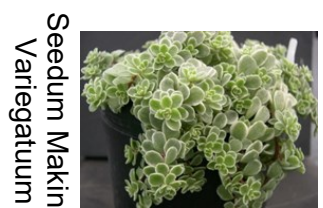
Sedum Makinoi Variegatum

Although every effort is made to assure that we offer quality plants, our suppliers give us no guarantee; therefore, we cannot replace plants that do not survive. In addition, Alleghany County 4-H does not assume responsibility for plants picked up after the designated date.