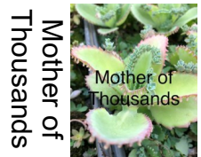
Mother of Thousands