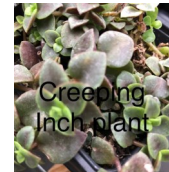
Creeping Inch Plant