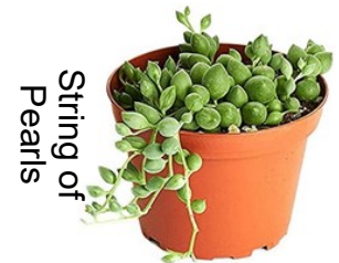
String of Pearls