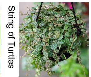
String of Turtles

ALTHOUGH EVERY EFFORT IS MADE TO ASSURE THAT WE OFFER QUALITY PLANTS, OUR SUPPLIERS GIVE US NO GUARANTEE; THEREFORE, WE CANNOT REPLACE PLANTS THAT DO NOT SURVIVE.