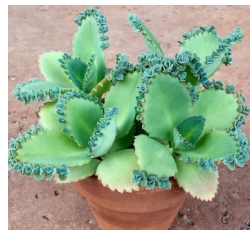
Mother of Thousands